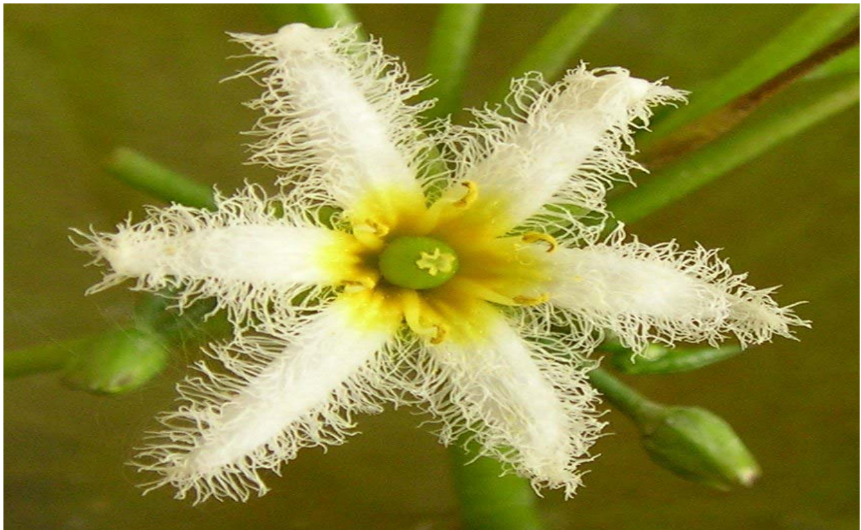
Fig. 3. Fully opened flower of Nymphoides indica having corolla lobes hairy inside.

Note: Nymphoides indica (L.) Kuntze is closely related to N. cristata (Roxb.) O. Ktze, but differs from the latter in having Petals of unusual feathery edges. In N. cristata (Roxb.) O. Ktze the petals have no feathery edges.