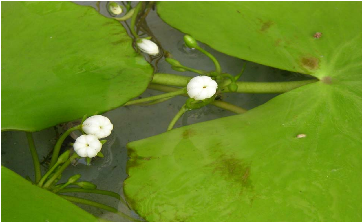
Fig. 2. Cluster of flowers of Nymphoides indica having corolla lobes glabrous outside.