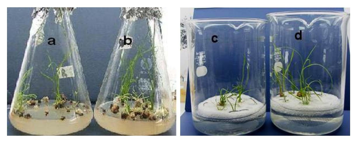
Fig. 2. Plantlets from 25 months old unadapted and polyethylene glycol adapted (a and b) cell lines of rice Oryza sativa L. cv. Swat 1 on regeneration medium and on water culture (c and d).

regeneration frequency of unadapted and LiCl adapted cell lines decreased to 30% and 10%, respectively (Fig. 1). The decrease in regeneration potential of over time is consistent with the general trend that cultured cells loose their capacity for plant regeneration after few subcultures (Abe & Futuhara, 1986; Gobel et al., 1986; Reddy, 1986; Binh et al., 1992). Where as, more reduction in regeneration frequency of LiCl adapted line may be associated with toxic effects of Li ions. On the other hand regeneration percentage of PEG adapted line increased to 80%. The trend of regeneration were 32% during first culture on regeneration medium 42% and 6% during subsequent 2<sup>nd</sup> and 3<sup>rd</sup> cultures respectively (Fig. 1). Furthermore, it was observed that plantlets of PEG adapted line were more vigorous and healthier than plantlets from other cell lines (Fig. 2).