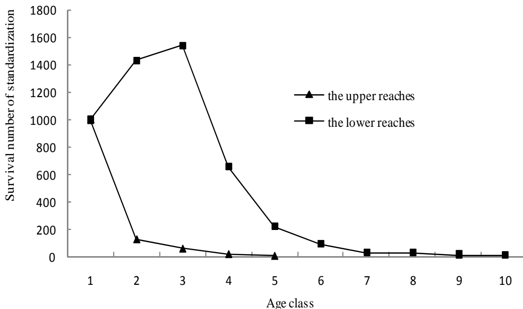
Fig. 2. Age structure of the P. euphratica population in upper and lower reaches of Tarim River.

Static life table and survivorship curve: We calculated the survival number of standardization ( l_x ), number of deaths ( d_x ), longevity ( T_x ), expected longevity ( e_x ), and periodical longevity ( L_x ), for every age class to determine P.euphratica population's static life table of both the upper and lower reaches of the Tarim River (Table 1). As we can see in this table, the oldest trees of the P.euphratica population in the upper stretch of the river were 50 years. The sapling mortality rate was high there, though the proportion of living saplings reached 83.12%. Life expectancy was maximized for age class 3, and then began to decrease. In spite of a different mortality rate for each age class, we found a tendency for the number of surviving individuals to gradually decrease with an