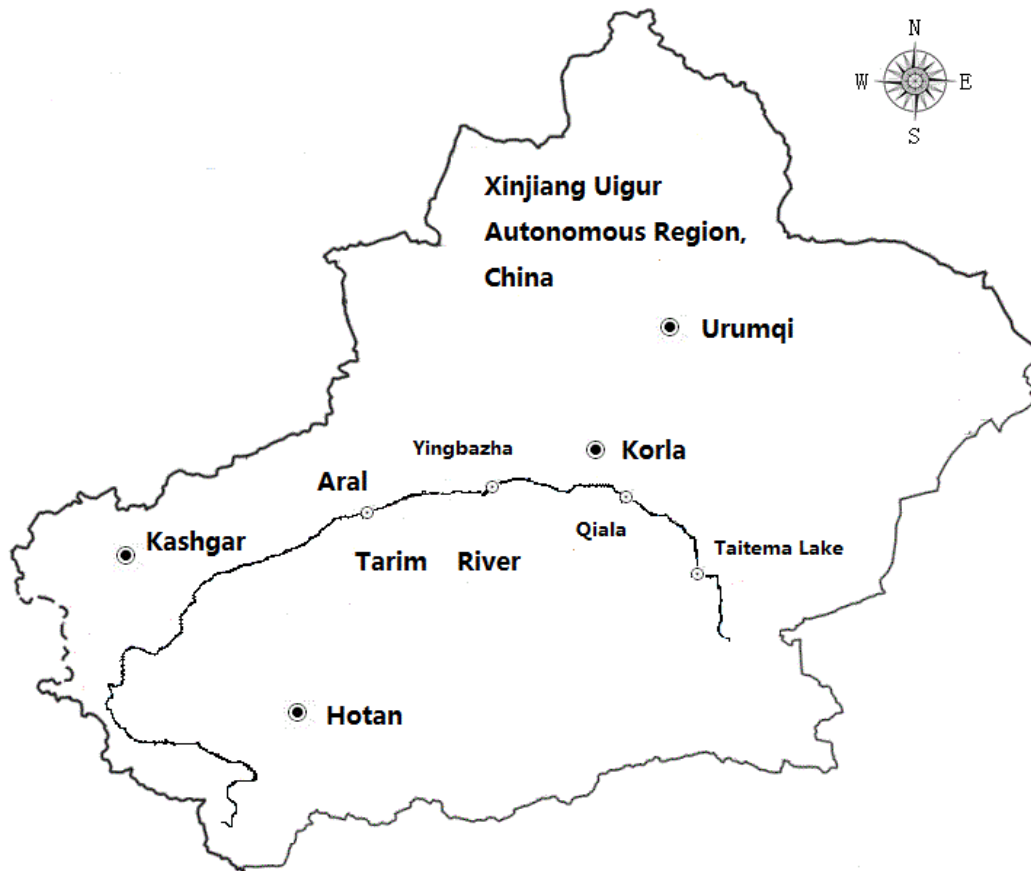
Fig. 1. The location of Tarim River.

The upper reaches have a typical climate of an arid zone with a yearly average temperature of 9.8°C. The annual precipitation varies from 42 mm to 76 mm, while the annual potential evaporation rate reaches 1,900-2,800 mm. (Huang et al. , 2007). Here, the dominant plant species are P.euphratica and Tamarix spp. Among herbaceous species, Phragmites australis , Apocynum venetum , Glycyrrhiza uralensis , and Alhagi sparsifolia are common. The lower reaches are situated in the area of a warm arid climate with a yearly average temperature of 10.8°C. Annual precipitation varies from 20-50mm, but the annual potential evaporation rate is as high as 2500-3000mm. Among trees, the dominant species is P.euphratica ; among shrubs, Tamarix spp. , Lycium ruthenicum and Halimodendron halodendron are often noted; and among herbaceous species, Phragmites australis , Alhagi sparsifolia , Karelinia caspica and Glycyrrhiza inflata are common (Liang & Liu, 1990; Liu & Dai, 1981).