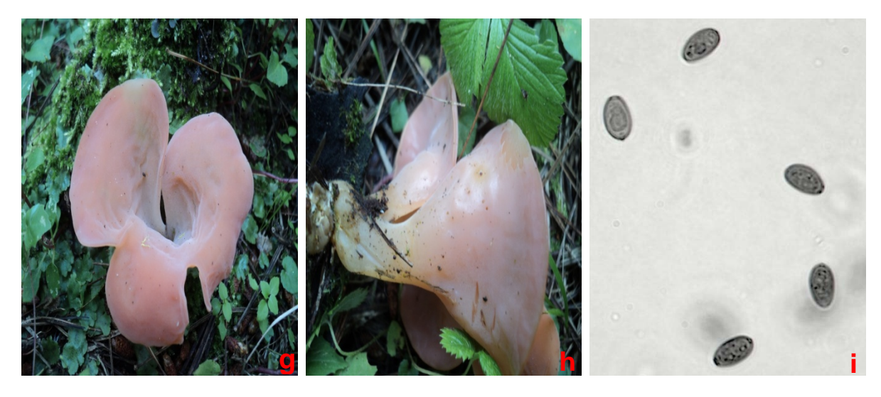
Fig. 4. Guepinia helvelloides (g- Dorsal view, h- ventral view, i- spores).