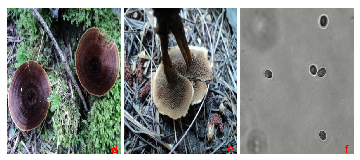
Fig. 3. Thelephora caryophyllea (d- Dorsal view, e- Ventral view, f- Spores)