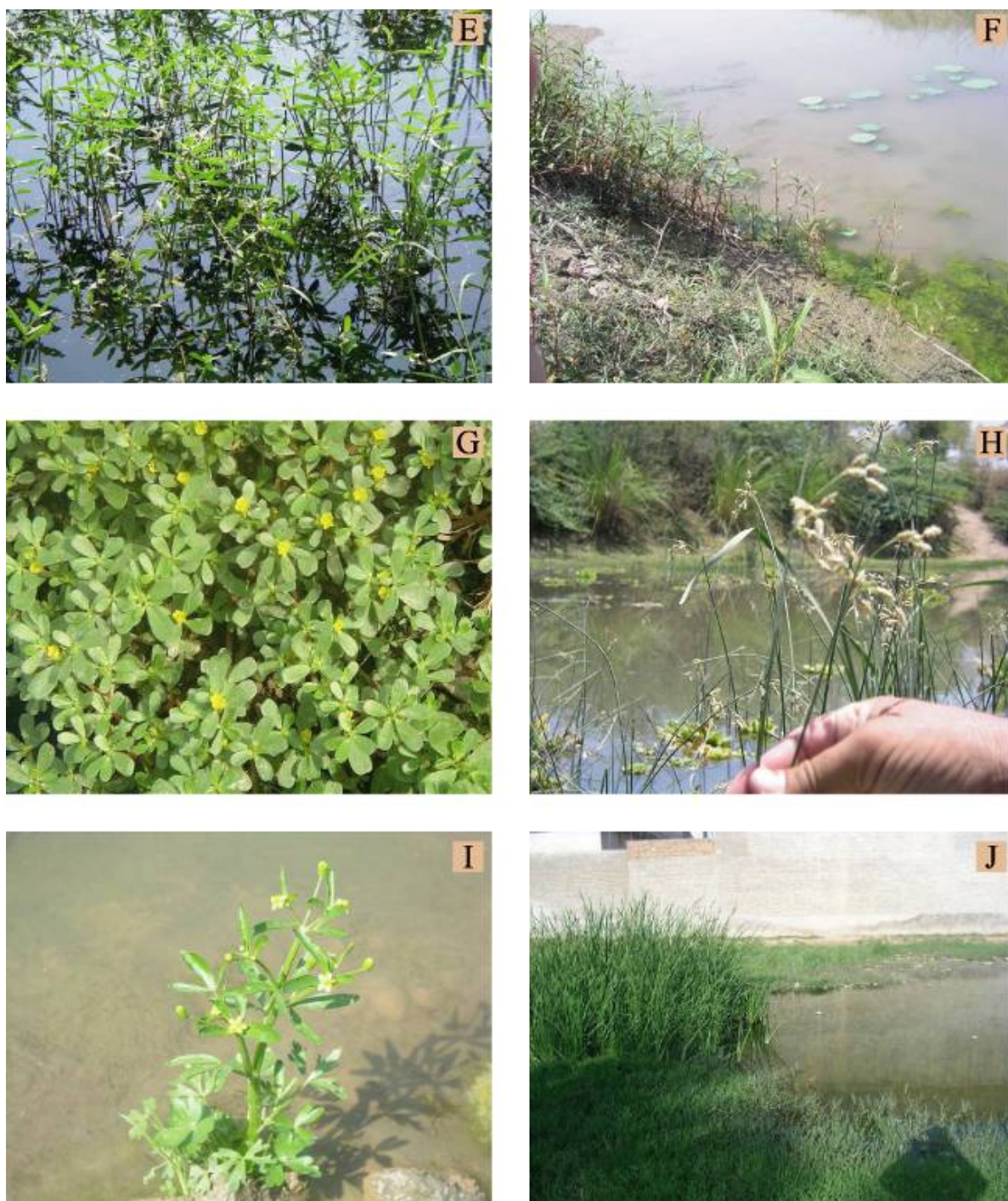
Fig. 4. E. Alternanthera sessilis , F. Polygonum glabrum , G. Portulaca oleracea , H. Schoenoplectus litoralis , I. Ranunculus scleratus , J. Typha domingensis ; Source: All the photos by author.