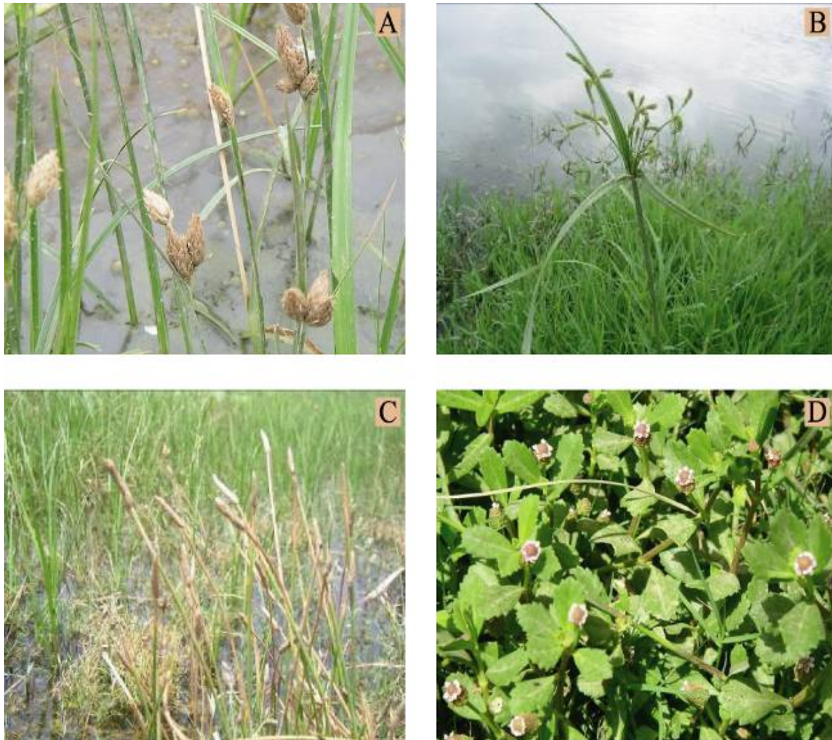
Fig. 3. A. Bolboschoenus affinis , B. Cyperus alopecuroides , C. Eleocharis palustris , D. Phyla nodiflora

Rumex (Polygonaceae) is a genus of more than 200 species, distributed in temperate regions especially in the Northern areas of both parts of the world; represented in Pakistan by 15 species (Bhopal & Chaudri, 1977b) and 2 hybrids (Qaisar, 2001). One species, Rumex dentatus L., was recorded from D.I. Khan District. It grows in disturbed habitat, often in moist areas, such as lakeshores and the edges of cultivated fields. This plant has allelopathic activity, producing substances that inhibit the growth of other plants near it (Wikipedia, 2012b).