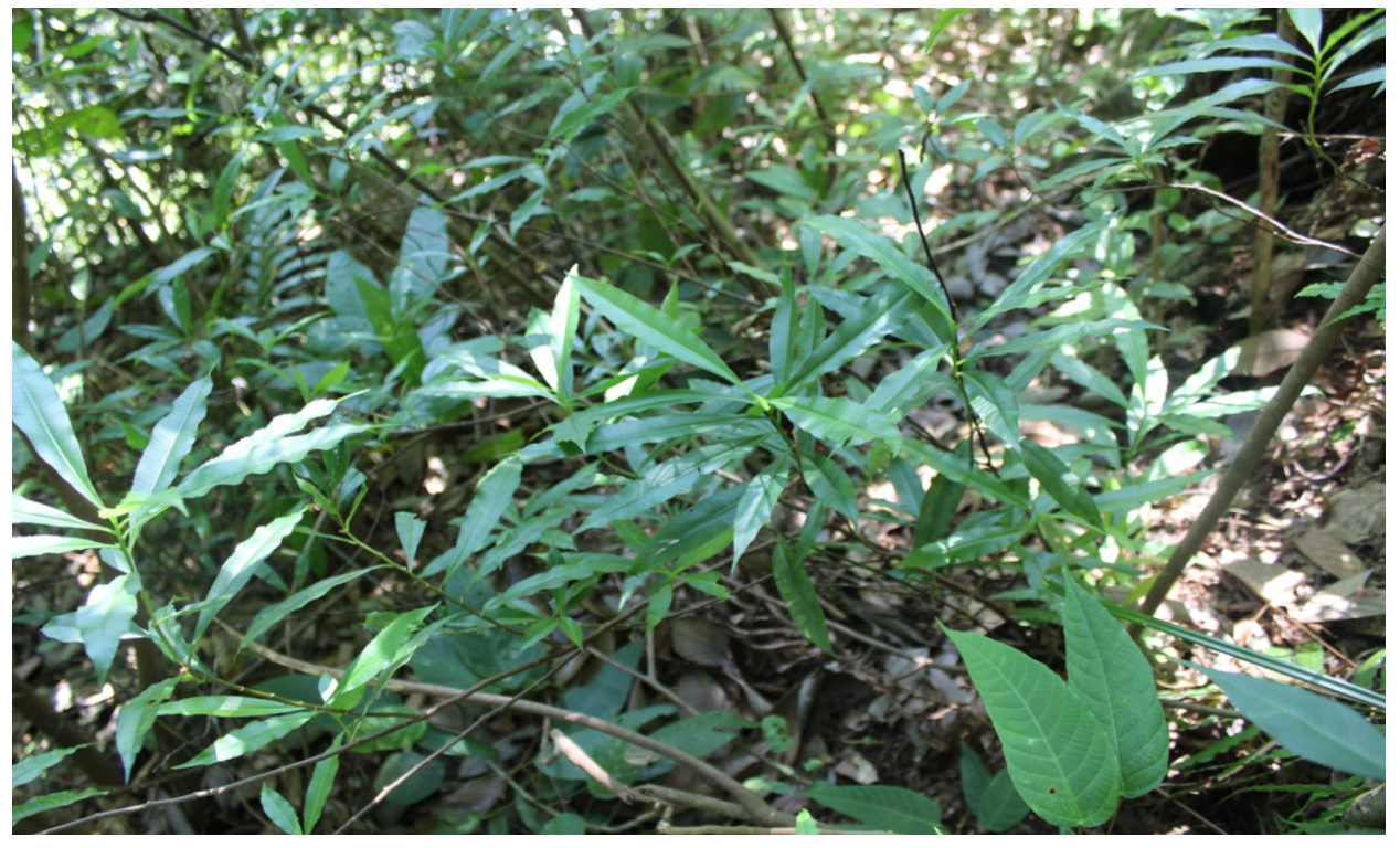
Fig. 1. Sauvagesia rhodoleuca (Ochnaceae).

Microsatellite genotyping: Eight high polymorphic microsatellite loci (SR3, SR4, SR5, SR6, SR7, SR8, SR10 and SR11) were used for genetic characterizations of all collected samples and the microsatellite procedure was performed as described by Li et al. (2010).