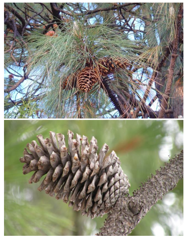
Fig. 2. Two views of Pinus engelmannii seed cones.