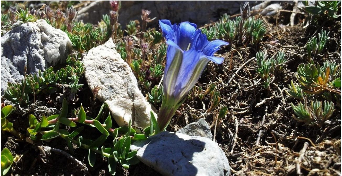
Fig. 1. A general view of Gentiana boissieri plant in nature.