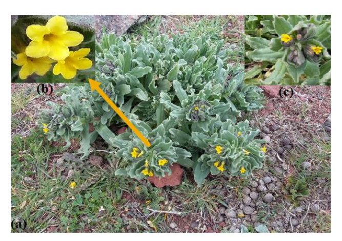
Fig. 2. The photos were taken from Mahmutlu Hill in May showing a- Natural habitat of Alkanna orientalis var. orientalis, b- Flowers c- Aboveground parts of the plant (Eskin, 2019)

Description of the sampling sites: A. orientalis var. orientalis was collected from wild flora in Aksaray province Turkey (Fig. 1). These species were acquired at 1380 m attitude in May (2019) during the flowering period (Fig. 2). The study area in Mahmutlu Hill is a tectonically very active region, and Hasan Mountain and Karataş volcanism are also located in the area. The soil of the area is alluvial and lime-free brown (Uygur & Erkul, 2015). pH of the study area is 8.10 and alkaline. However, the bioclimatic level of this location is semi-arid Mediterranean climate with very cold winters (Akman, 2011). The meteorological data for Aksaray during the period between 1929 and 2020 shows, that the mean annual temperature is 12.1°C. In addition, the annual average precipitation is 362.3 mm (Anon., 2021). It indicates that the evaporation is quite high in the region and effects the soil structure (Demir et al., 2021).