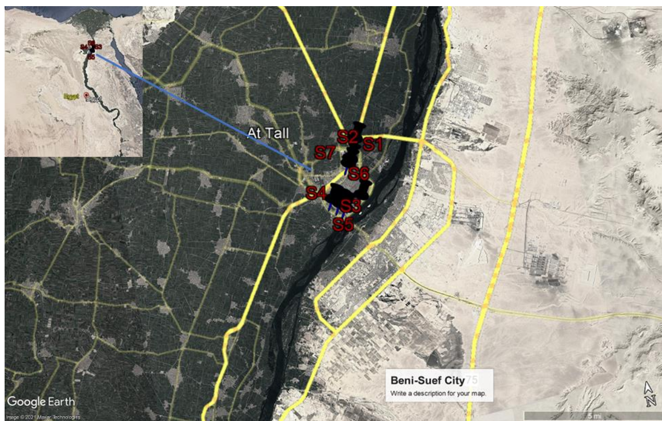
Fig. 1. Distribution map of the studied city.

Life forms: Seven life forms were recorded in the current study (Fig. 2b). The majority of species (40 species, ca. 70%) were therophytes, followed by hemicryptophytes (6 species, ca. 10%), then geophytes (5 species, ca. 9%), but chamaephytes and phanerophytes were represented by an equal number of species (2 species, ca. 4%). In addition, hydrophytes and geophyte-halophytes were represented by one species each ( ca. 2%).