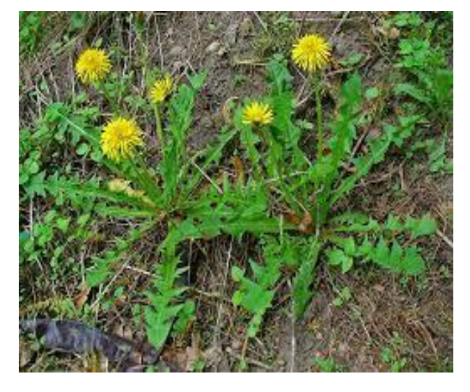
Fig. 3. Taraxacum officinale with flower.