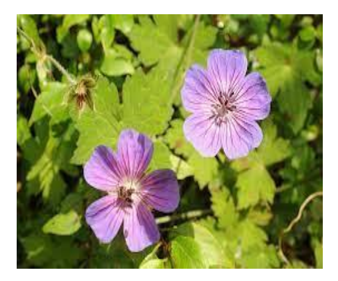
Fig. 1. Geranium wallichianum with flowers.

at the Central Hi-Tech Laboratory, University of Poonch Rawalakot, Pakistan. The process recommended by the Association of Official Agricultural Chemists (AOAC, 2000) was divided into two parts, with the sample being digested using nitric-perchloric acid. In the 1<sup>st</sup> phase, 250ml capacity beaker was taken and one gram of wet sample and concentrated HNO<sub>3</sub> (10ml) were taken. Hot plate (Model) was used to boil the mixture to oxidize all easily oxidizable materials for 30-45 min. The liquid was then allowed to cool before being re-heated with 70% HClO<sub>4</sub> (5ml) until thick white vapors formed. After cooling, distilled water (20mL) was added, and the liquid was heated one more time to remove any odours. After chilling the solution, the filtrate was prepared in a 50mL volumetric flask using Whatman No. 42 filter paper and <0.45 mL filter paper, and the filtrate was diluted to 50mL with distilled water. In 2<sup>nd</sup> phase, after digestion, an atomic absorption spectrometer (AAS) was used to quantify heavy metals ( \mu g g^{-1} ) including Magnesium (Mg), Zinc (Zn), Iron (Fe), Calcium (Ca), Arsenic (As), Cupper (Cu), Phosphorus (P), Cadmium (Cd), Lead (Pb) and Mercury (Hg) using the Colagar et al., (2009) methodology.