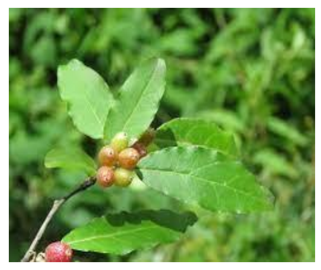
Fig. 2. Elaeagnus parvifolia with fruits.