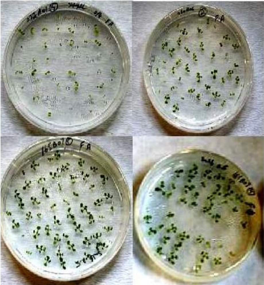
Fig. 1. Resistant plants of Arabidopsis T-DNA mutants germinated on MS having Sulfadiazine.