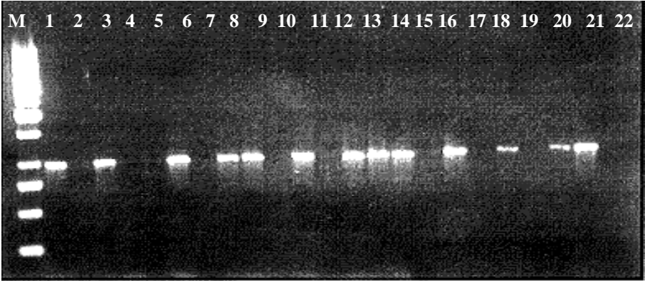
Fig. 2. PCR amplification of the PAM-74 mutant with gene specific primer.