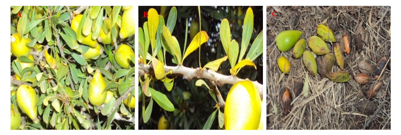
Fig. 5. Seed set. A: leaves turn yellow (Stidia argan); B: leaves turn yellow (Oggaz argan); C: fall fruits and leaves in June.

Seed set: Period from June to September, during the summer period, some leaves turn yellow in almost all strata making. A relatively high leaf fall begins, unlike shady giving a less dense green port reddish colors because all the fruit to reach maturity, which is called the stage of maturation. At this stage the branches of the year (fertile branches) appear as branching of the previous year, as the flowers finish their pollination produce berries dark green color with thorny ends in late July. The beginning of August is the stage of fruit set; the branching of the previous year becomes naked, because almost all fruit fell to the ground for all strata studied the tree, except some one remaining in the form of nuts (Fig. 5).