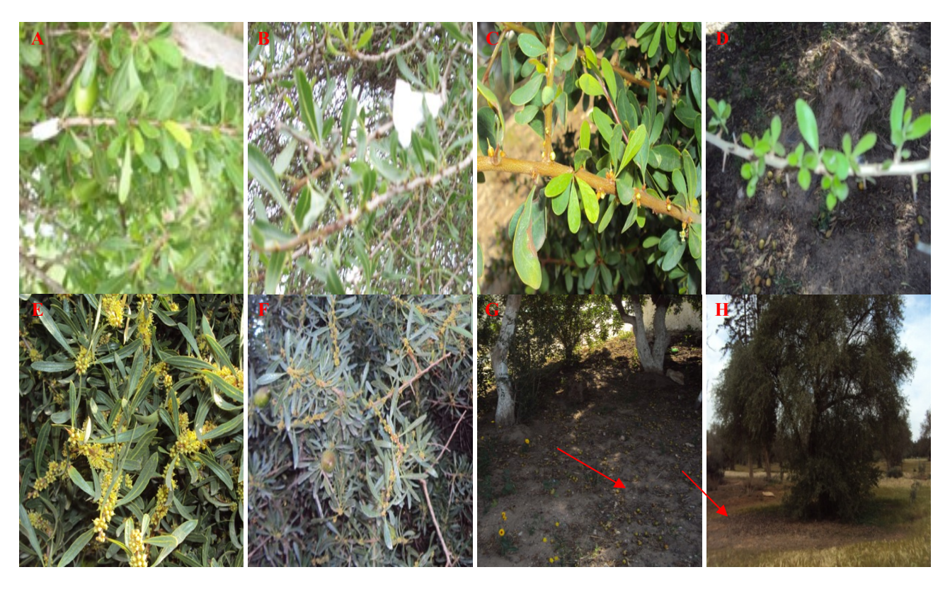
Fig. 6. Foliation argan. A: foliation early in October (Stidia argan); B: foliation early in October (Oggaz argan); C: open green buttons and leaves formation (Stidia argan); D: open green buttons and leaves formation (Oggaz argan); E: wide and fully developed leaves in spring (Stidia argan); F: wide and fully developed leaves in spring (Oggaz argan); G: drop adult yellow leaves on the ground (Stidia argan); H: drop adult yellow leaves on the ground (Oggaz argan).

and thickness, they are grouped from 1 to 5 on the same knot at the extremity of branches. Their color becomes completely dark green and the superior side becomes soft, the new leaves continue growing and are lignified. For both expositions (east and west), no variation has been registered on the leaves (Fig. 6).