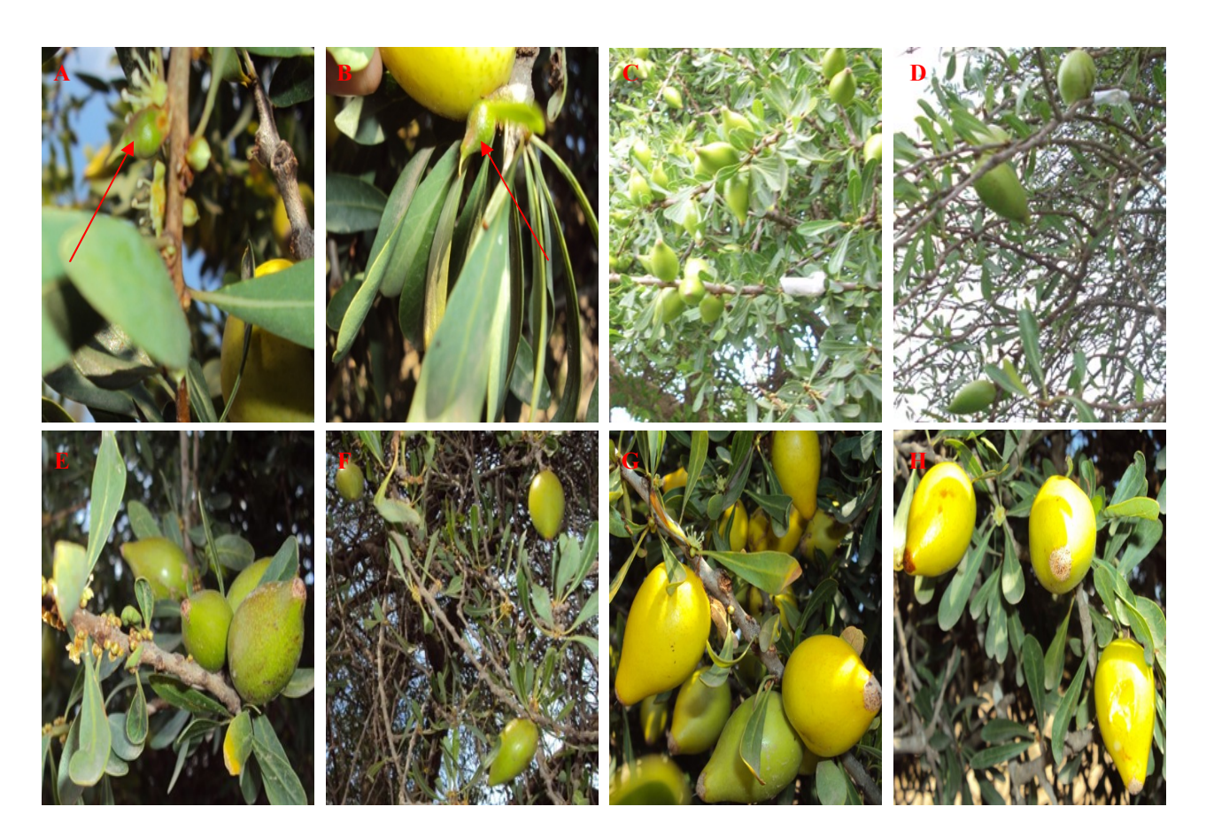
Fig. 4. Fructification. A: early fruiting (Stidia argan); B: early fruiting (Oggaz argan); C: new green fruit finish their magnification in Winter (Stidia argan); D: new green fruit finish their magnification in Winter (Oggaz argan); E: fruits in spring (Stidia argan); F: fruits in spring (Oggaz argan); G: fruit ripening in May (Stidia argan); H: fruit ripening in May (Oggaz argan).