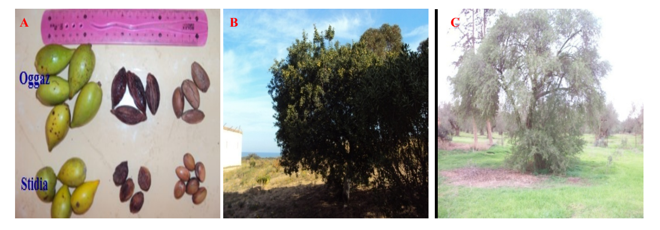
Fig. 2. A: mature fruit, fleshy pericarp (pulp) was dried fruit and seeds of the two subjects (Oggaz and Stidia). B: Stidia tree; C: Oggaz tree.

The rest of the phenological characteristics are almost identical in both sources (or Oggaz Stidia), the results of different observations made in situ on the two subjects of the study: the experimental shaft of the Oggaz station (Mascara) and experimental forest tree house Stidia (Mostaganem) of June of the current year to June of the following year for two consecutive years (2010-2011 and 2011-2012). The 4 stages of phenology are shown in the following illustrations: