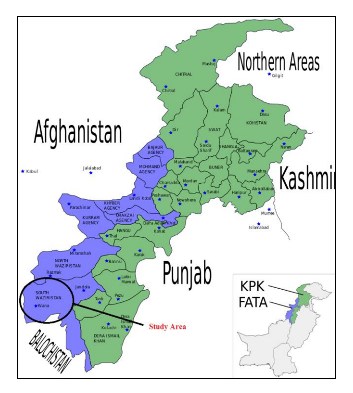
Fig. 1. Area map of South Waziristan Agency, Pakistan.

Study area: South Waziristan Agency (SWA) is the largest agency of the Federally Administered Tribal Areas (FATA) of Pakistan; spread over an area of 6,620 square kilometers; accounting for 24.3% of FATA's aggregate area. SWA is limited by North Waziristan Agency in north, Tank in east, Baluchistan in south and Afghanistan in west (Fig. 1).