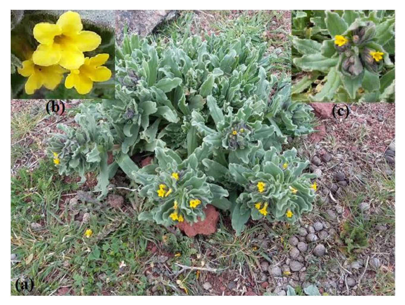
Fig. 2. The photos were taken from Mahmutlu Hill in May showing a- Natural habitat of Alkanna orientalis var. orientalis, b- Flowers c- Aboveground parts of the plant (Eskin, 2019)

TruSpec Micro device was used as the elemental analyzer (CNS). TruSpec Micro delivers optimal performance in carbon, nitrogen, and sulfur determination in solid micro samples. The efficiency and speed of TruSpec Micro CNS is the result of the combination of a flow-through carrier gas system used in conjunction with individual, highly selective, infrared (IR) and thermal conductivity detection systems. Weighed micro samples (soil or plant) are placed into the autoloader of TruSpec Micro and are automatically dropped into the hightemperature (950°C) for carbon nitrogen and (1350°C) for S combustion furnace, allowing the sample to combust.