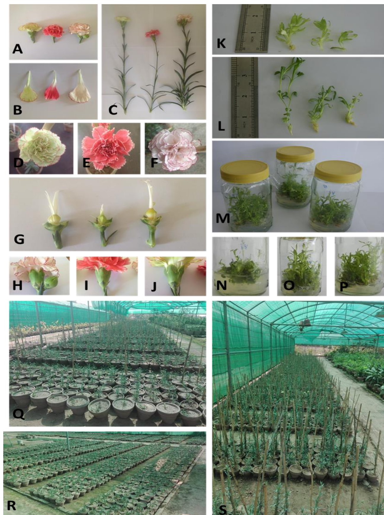
Fig. 1. Showing morphological and In vitro response of Elite varieties of Carnation where A: Complete flower of elite varieties, B: Complete flowers with flower stem and maximum size that attained by the stem in Islamabad, C: Flower Petal shape and size compared with each other. F-G complete flower size close-up, color of flower along with whorls of the flowers. H: is Gynoecium portion of the flower of three varieties, I-J: Calyx portion of three varieties. Micro-propagation portion starts from K: small plantlets from inoculation vessel. M-P: Culture vessels, R: Mature plants from plant tissue culture lab., S: plants are ready for sale.