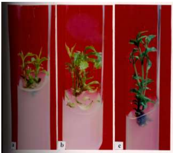
Fig. 1. (a) Induction of multiple shoots from nodal explant on MS+BA (2 \mu\text{M} ) – 2 weeks old culture. (b) Proliferation of multiple shoots on MS+BA (2 \mu\text{M} ) – 3 weeks old culture. (c) Multiple shoot regeneration from nodal explant on MS+BA (5 \mu\text{M} ) – 3 weeks old culture.

Nodal explants of Clerodendrum incisum when cultured on MS basal medium supplemented with BA (1, 2, 5 and 10 \mu\text{M} ) and Kn (1, 2, 5 and 10 \mu\text{M} ) showed direct shoot bud differentiation after 2-3 weeks of inoculation. Low concentrations of BA (1 and 2 \mu\text{M} ) were effective but BA (5 \mu\text{M} ) was found to be optimal for highest number of shoot multiplication (Fig. 1; a,b,c). A reduction in number of shoots was noticed at 10 \mu\text{M} . BA was found more effective than Kn for shoot regeneration (Tables 1 & 2).