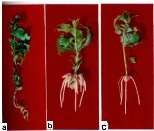
Fig. 2. (a) In vitro root induction in microshoot on MS½ + IBA (5 µM) – 5 weeks old culture. (b) In vitro root induction from the basal cut end of microshoot on MS½ + NAA (5 µM) – 4 weeks old culture. (c) Induction of roots from basal cut end of microshoot on MS½ + IAA (5 µM) – 4 weeks old culture.