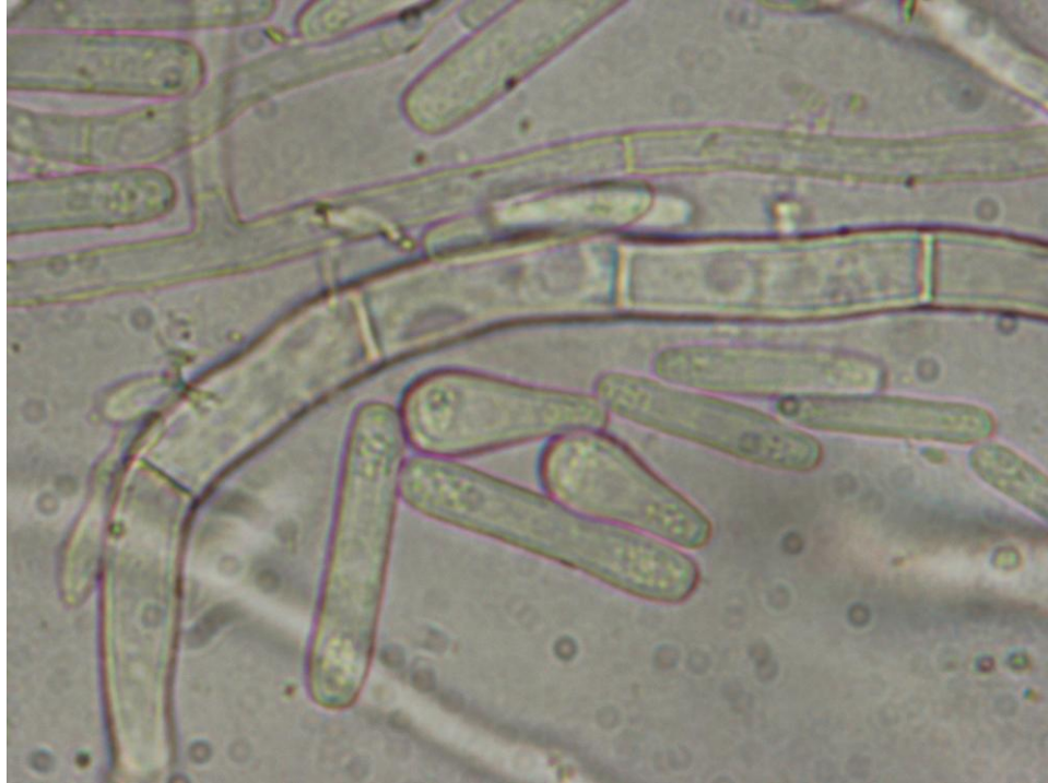
Fig. 2. Conidia of Ceratocystis fimbriata on PDA medium (x1000).