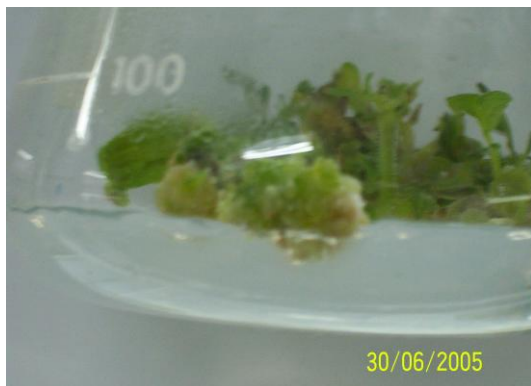
Fig. 7. Regeneration from hypocotyls of tomato cv Moneymaker.

About 22.8% hypocotyls produced embryogenic calli. In 15.2% hypocotyls shoot regeneration was observed. About 22% leaf discs showed differentiation (Table 7). Tomato shoots obtained were shifted to \frac{1}{2} MS medium containing IBA (0.1 mg/l) and BAP (0.0025 mg/l) for rooting in T 6 (Fig. 8). Multiple shoot formation with roots was observed (Fig. 9).