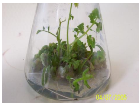
Fig.9. Multiple shoot formation.