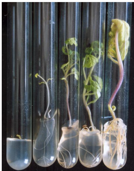
Fig. 1. Different growth stages of In vitro seedlings of tomato cv. Moneymaker.

After surface sterilization, 363 seeds were inoculated on plain MS medium. Germination rate was 68.8%, 3.0% seeds were contaminated and remaining were unable to grow as given in Table 2 and Fig. 1.