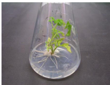
Fig. 8. Root formation.

About 22.8% hypocotyls produced embryogenic calli. In 15.2% hypocotyls shoot regeneration was observed. About 22% leaf discs showed differentiation (Table 7). Tomato shoots obtained were shifted to \frac{1}{2} MS medium containing IBA (0.1 mg/l) and BAP (0.0025 mg/l) for rooting in T 6 (Fig. 8). Multiple shoot formation with roots was observed (Fig. 9).