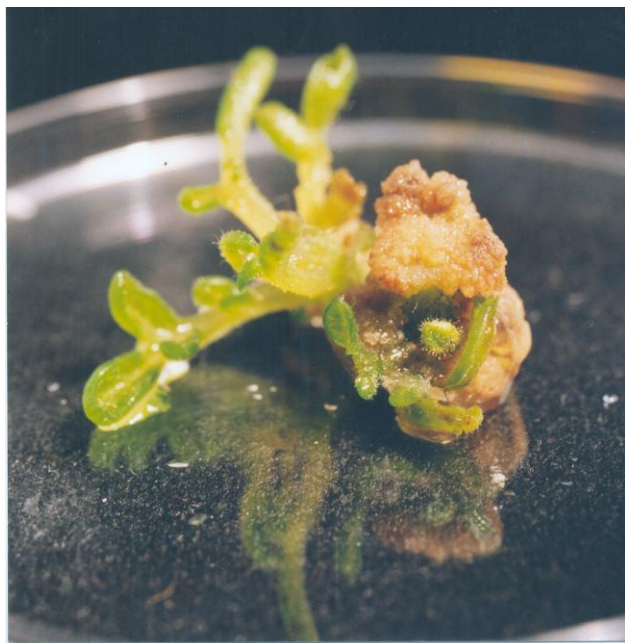
Fig. 6. Shoot regeneration from hypocotyl callus culture of tomato cv. Moneymaker obtained on MS medium supplemented with Zeatin (1 mg/l) and IAA (1 mg/l).

In the present study also, best results were obtained by using Zeatin and IAA (T 4 ). About 69% hypocotyls exhibited regeneration (Fig. 6). Callus as well as leaf disc segments were transferred to regeneration medium. None of them showed any regeneration (Table 5). Costa et al. , (2000) used cotyledonary-derived explants of two processing tomato cultivars ( L. esculentum cvs. IPA-5 and IPA-6). After three weeks, 'IPA-5' and 'IPA-6' cultivars presented shoot regeneration with (average of 97 and 80%, respectively) when cultured on MS medium supplemented with 1 mg zeatin and 0.1 mg IAA. Ichimura et al. , (1995) successfully cultured cotyledon segments of tomato on several kinds of supporting materials made from polyester, ceramic, wood pulp and cotton fiber. Callus was induced by using 0.1 mg/l IAA and 1.0 mg/l Zeatin.