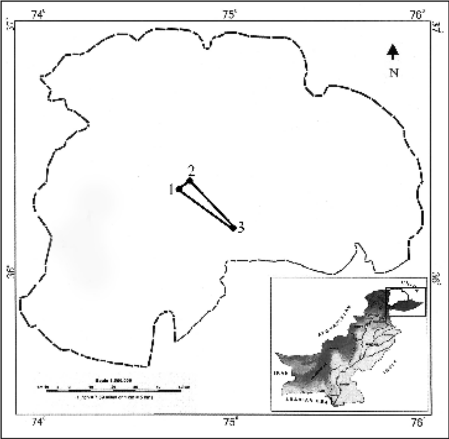
Fig. 2. Distribution of Androsace russellii 1, Shatu Bar, Culmit; 2, Ultr Nullah, Karimabad; 3, Gharsa glacier, Nagar.